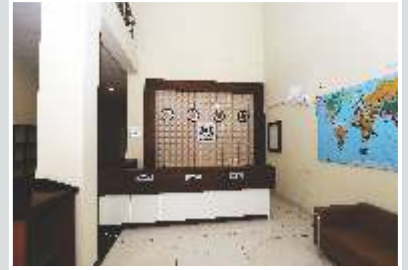
Front Desk (HM)