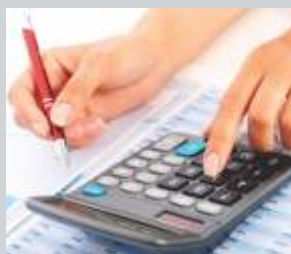
B.Com (Honors) Bachelor of Commerce