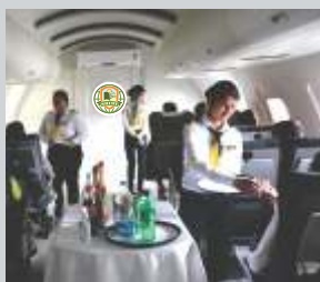
BTMM Bachelor of Tour & Travel Management