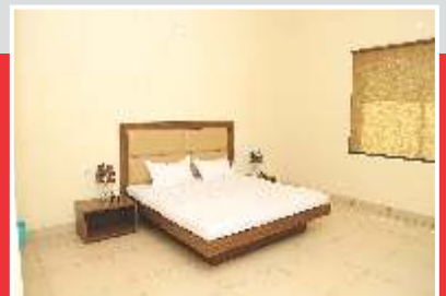
Guest Room (HM)