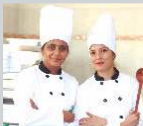
BHMCT Hotel Management & Catering Technology