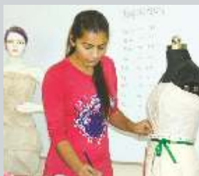
B.Sc (F.D.) Bachelor of Fashion Design