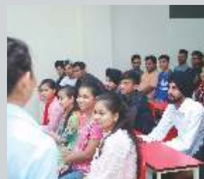
BBA Bachelor of Business Administration