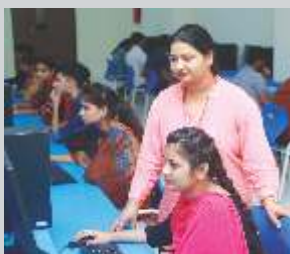
BCA Bachelor of Computer Applications