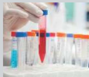
BMLS Bachelor of Medical Lab Sciences