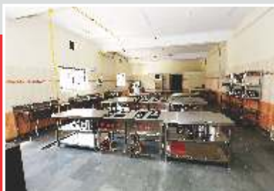
Basic Training Kitchen (HM)